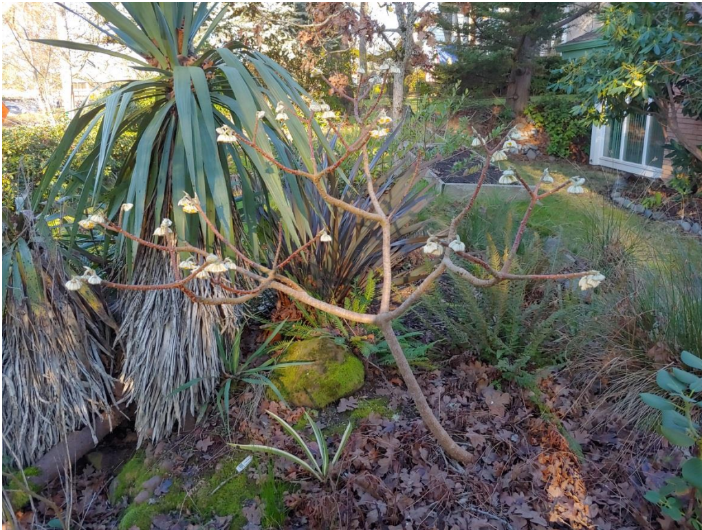
Edgeworthia Chrysanthum (Chinese Paper Bush)