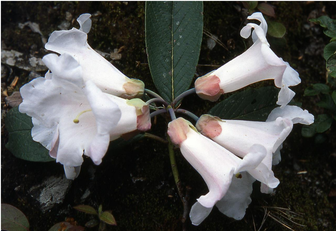
R megacalyx: Fragrant and beautiful. One of the Maddenias (subtropical rhododendrons). We passed through this zone going up every mountain, on our way to higher elevations. This way we saw many of the species in subsection Maddenia.