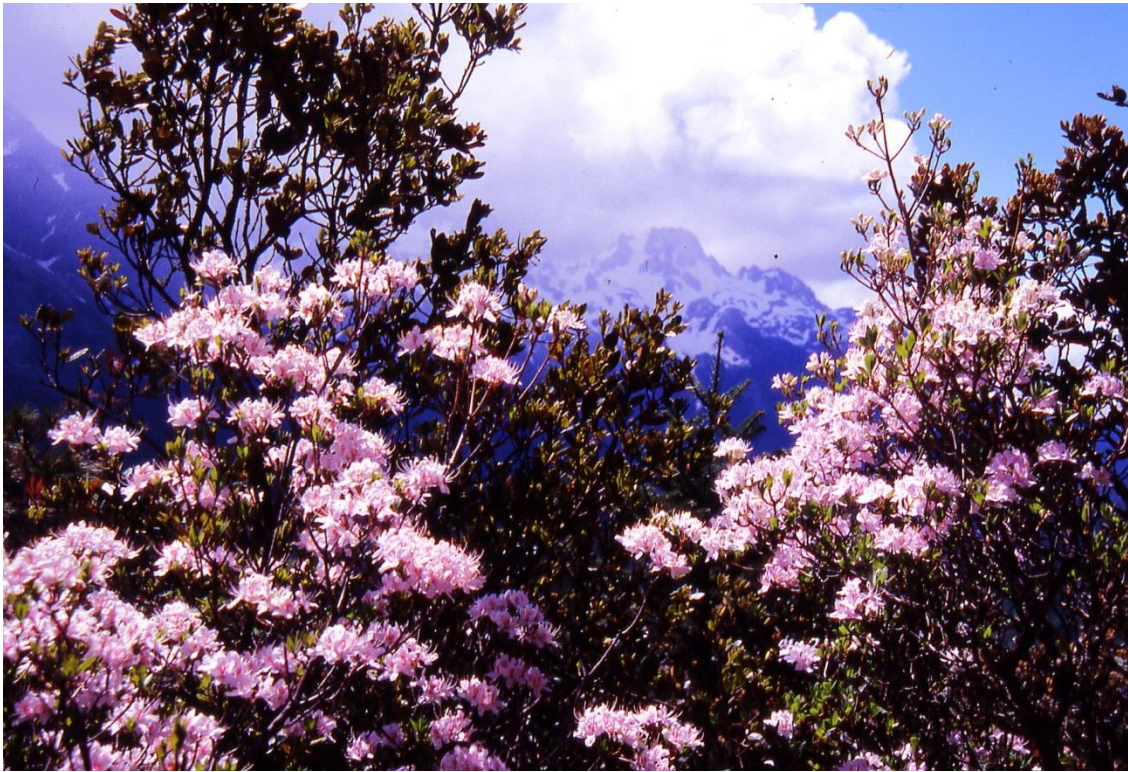
Jinfoshan (shan = mountain) known as Jade Dragon Mountain, framed by R yunnanense