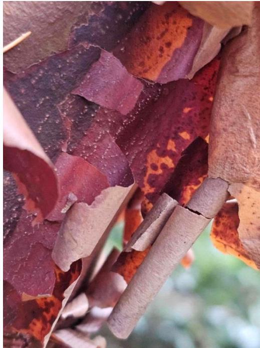
Acer griseum (paperbark maple)