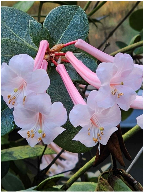
R 'Tuba' in conservatory