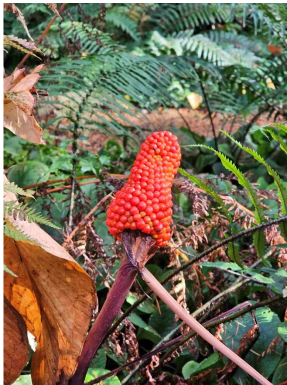
ariseama fruit (seeds)